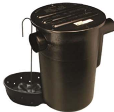
45L polymer grease trap

is available, and this type is standard for the Concrete Tra Risers are also available for a types. Note that all these units are intended for residential property and are not inter